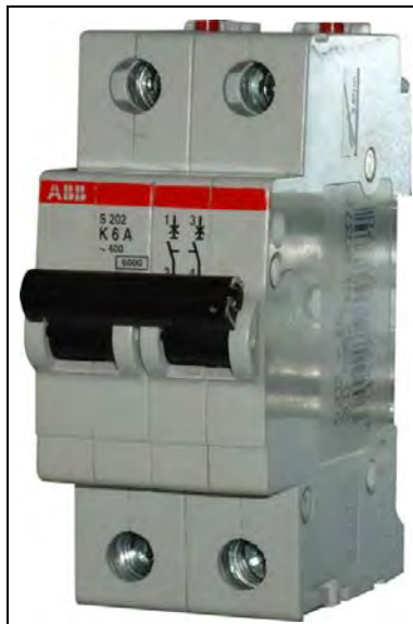
Figure 1: Bypass Switch